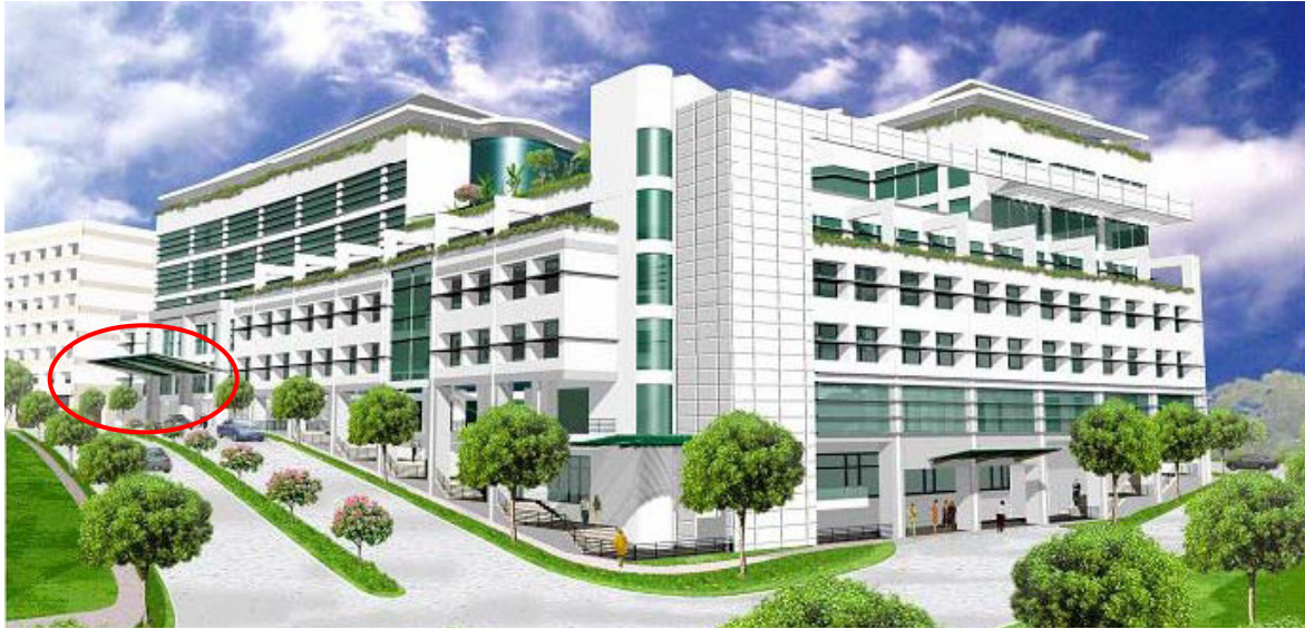
Pic 1: MEGTW-LEO Building (artiest impression)

The plan, photos and other information given below are to serve as only a guideline for the intended location of the BIPV system. The tenders are advised to visit the site for necessary roof measurement and make him/her self thoroughly acquainted with the location and all aspects of the Works.