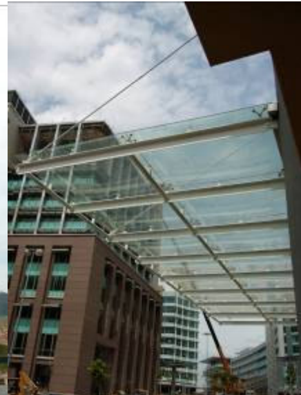
Pic 3: View from east