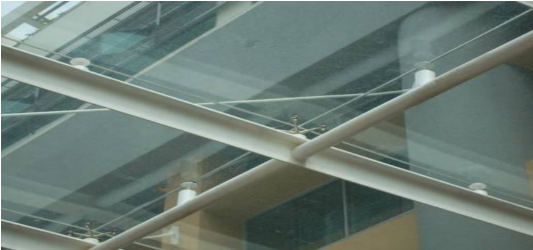
Pic 4: View from below (detail fixation)

The canopy is constructed with two rows (west-east) glass panels (each panel is approximately 2.7m by 2.1m). Each row has eight glass panels fix to a quadra-pod on the metal structure.