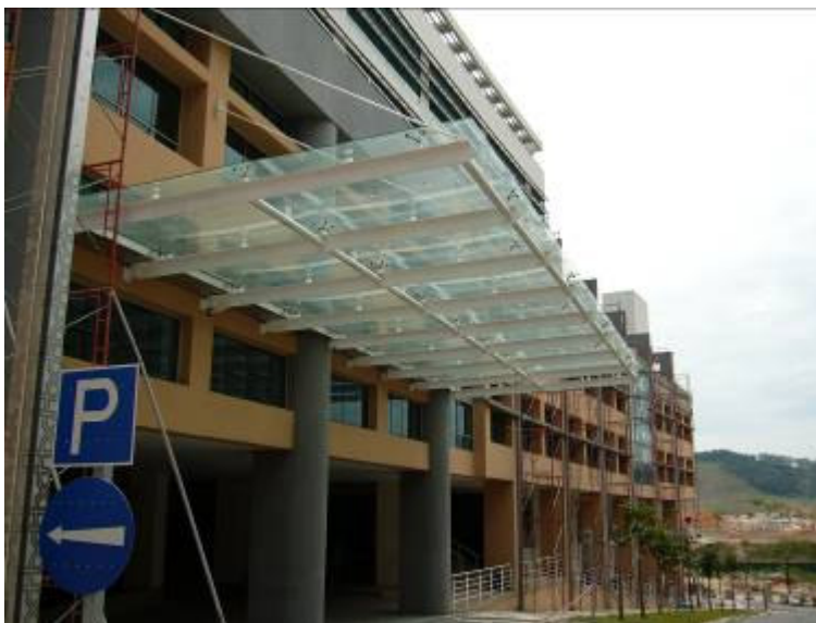
Pic 2: View from west