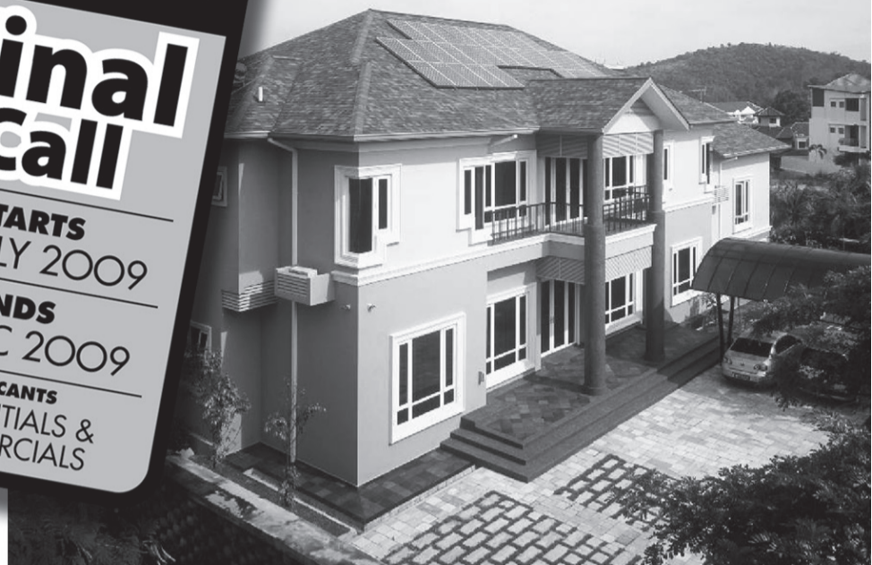
House which generates electricity from the sun. 10kWp BIPV bungalow at Kajang, Selangor.