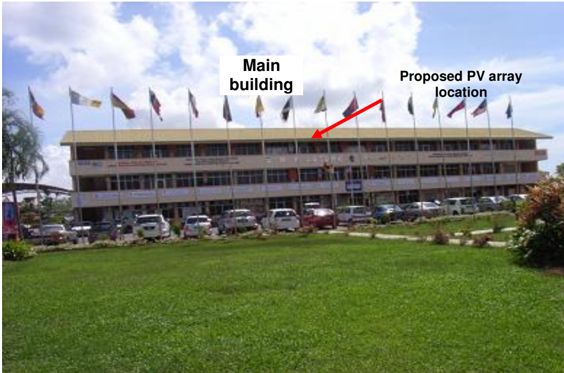
Side view of SMK Lutong (PV array to be installed at main building roof). APVSPs are required to measure and ensure that the roof space is sufficient to locate the PV array.