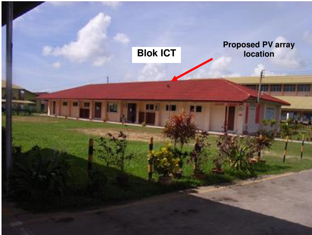
Side view of Makmal ICT SMK Lutong (PV array to be installed at Makmal ICT roof). APVSPs are required to measure and ensure that the roof space is sufficient to locate the PV array.