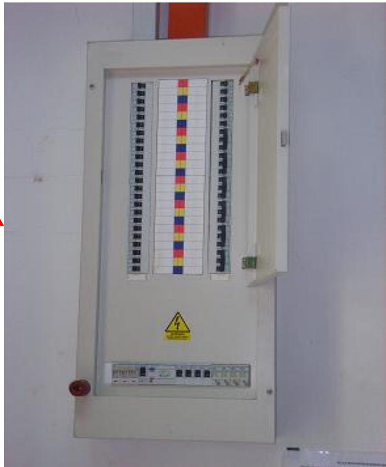
Proposed electrical combiner box location: inside the makmal ICT room.